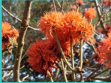
African Nature, by P.Sundin

The members of the project group had several objectives, such as: